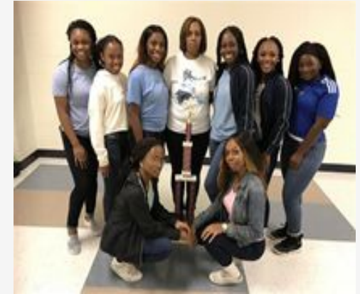
Women in Math -ECSU 1st Place Spirit Award